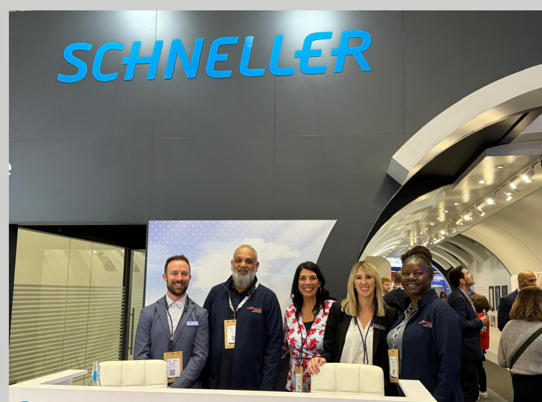
Connecting with SCHNELLER representatives

These engagements play a critical role in strengthening our supply network and ensuring continued access to quality components and solutions for our clients.