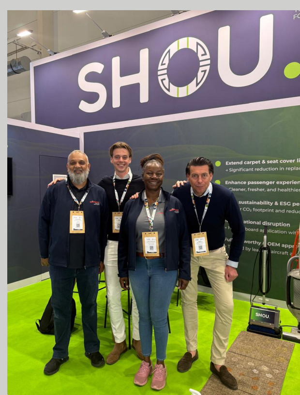
Engagement with SHOU team