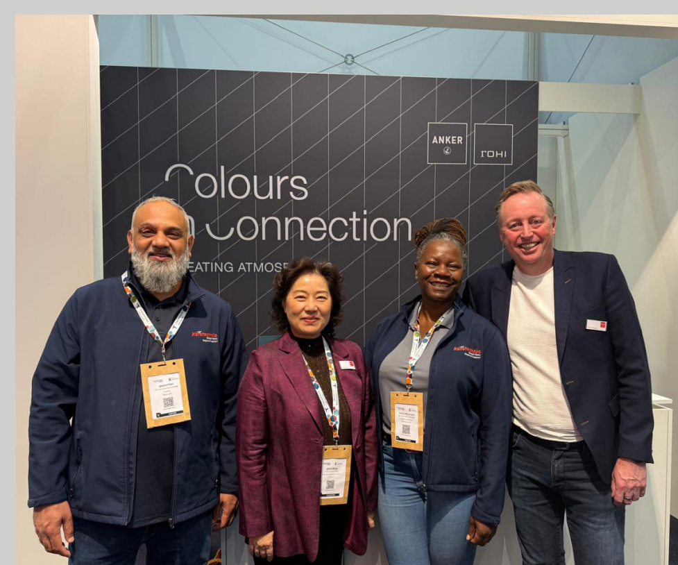
Meeting with ANKER representatives

During AIX, Aerotechnic connected with key supplier partners, reinforcing existing relationships and exploring new opportunities for collaboration.